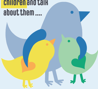
DEUTERONOMY 6:6-7, NRSV